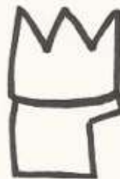
Mordecai's Hair and Crown in Profile